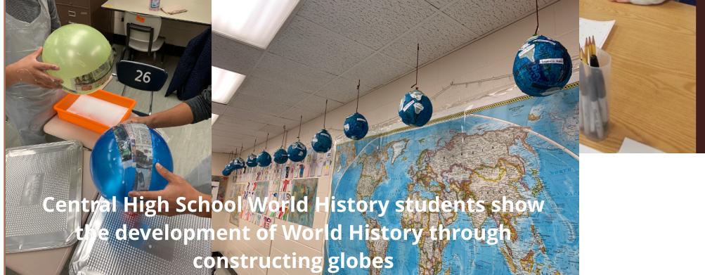
Central High School World History students show the development of World History through constructing globes

We want to celebrate the great learning we see taking place in your classrooms everyday! Throughout the school year, as you are teaching and your students are learning and exploring social studies, share with your colleagues the good things that are happening in your schools. Send us pictures of your students engaging in the Social Studies Practices, digging into primary and secondary sources, analyzing, justifying, debating, creating, and being social scientists! We see these things happening everyday as we are visiting schools and classrooms-let your fellow social studies teacher share in your students' successes!